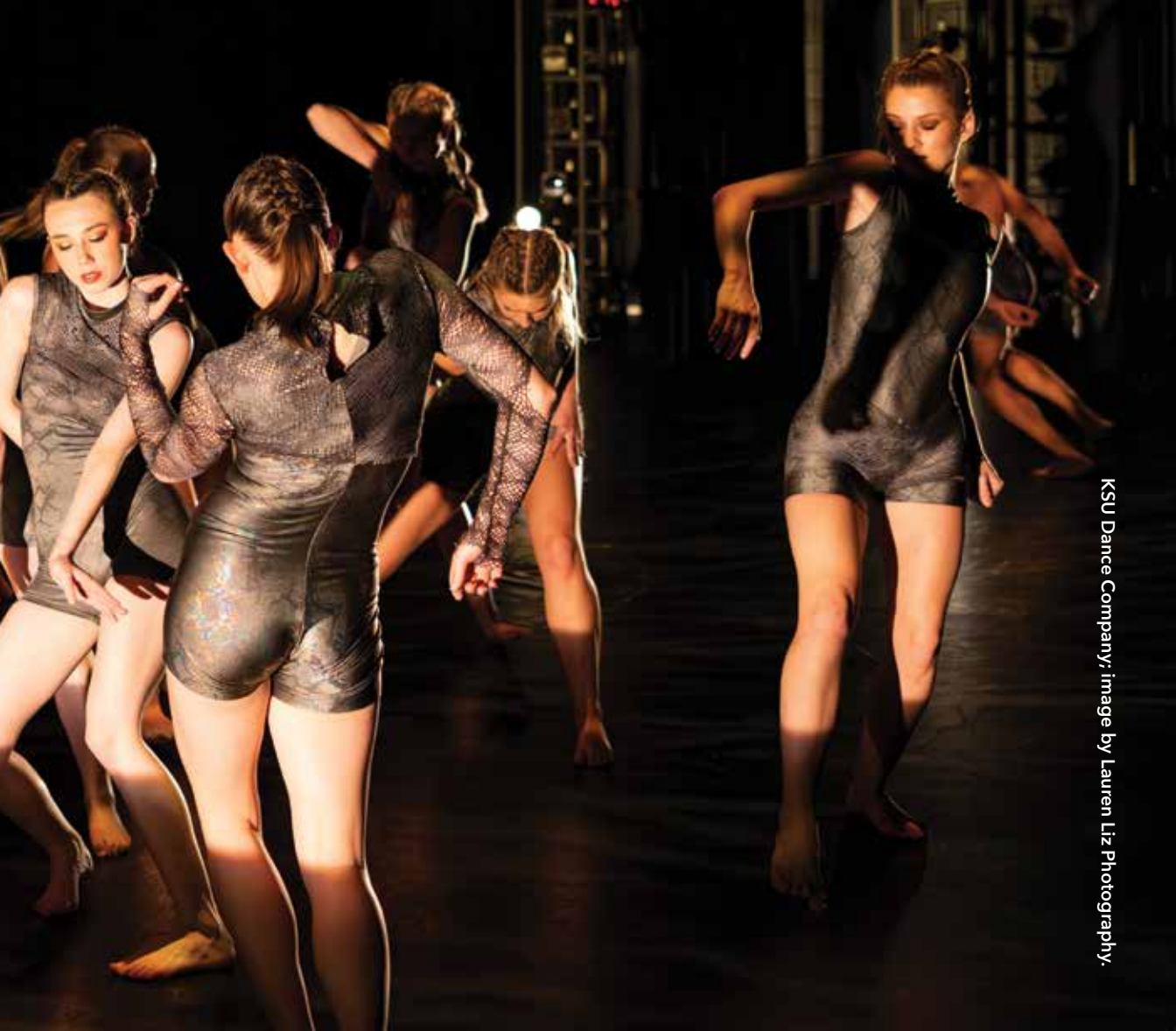
KSU Dance Company

T he Department of Dance at Kennesaw State University is Georgia's largest undergraduate dance program, and home to Atlanta's premiere dance theater. We offer a Bachelor of Arts in Dance, unique professional partnerships, extensive co-curricular activities, and exciting performance and choreographic opportunities.