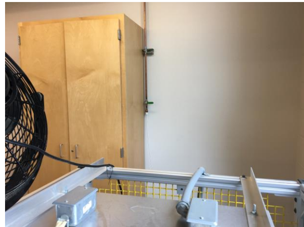
The associated air-assist lever, located to the left of the vacuum forming machine, behind the wood cabinet.