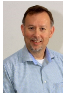
David Witt Management