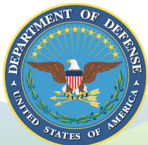
Department of Defense

Thousands of Boren Awards alumni have started careers in these priority agencies: