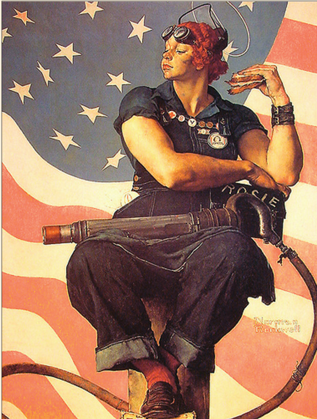
'Rosie the Riveter'