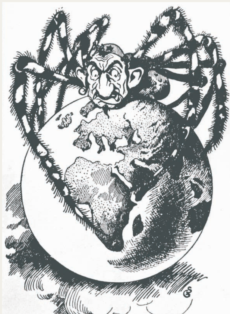
Cover of a popular French edition of the Protocols of the Elders of Zion , circa 1934. Captioned "Le Peril Juif" - "The Dangerous Jew."