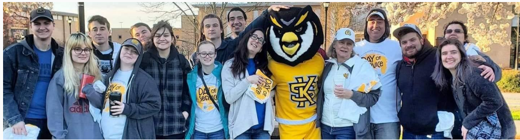
CYAAR Team with Scrappy, 2018